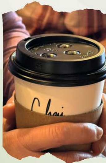
Warm hands, warm hearts.