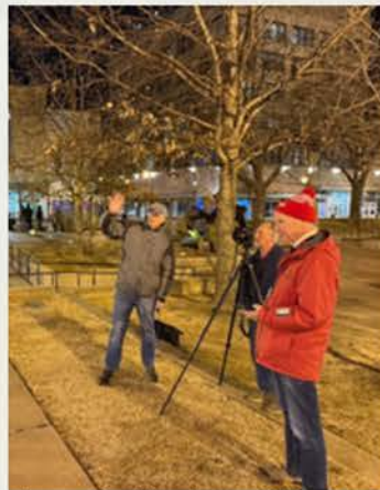
Time Collectors CG met on the square for some nighttime photography.

More information on Capture Groups can be found on the private Facebook group entitled "Southwest Missouri Camera Club (Paid Members Only Group)".