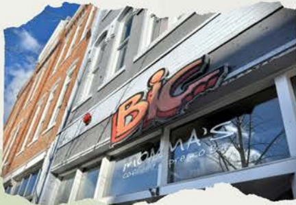
Coffee & espresso, downtown